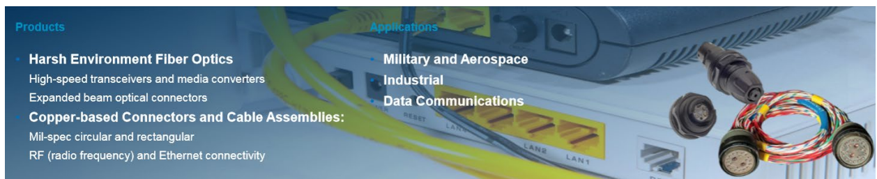
Figure 7 – Bel Fuse Inc. – Connectivity Product Applications and Sample Connector

Bel offers a comprehensive line of high speed and harsh environment copper and optical fiber connectors and integrated assemblies, which provide connectivity for a wide range of applications across multiple industries including commercial aerospace, military communications, network infrastructure, structured building cabling and several industrial applications. Typical applications shown in Figure 7 and Product Map in Figure 8.