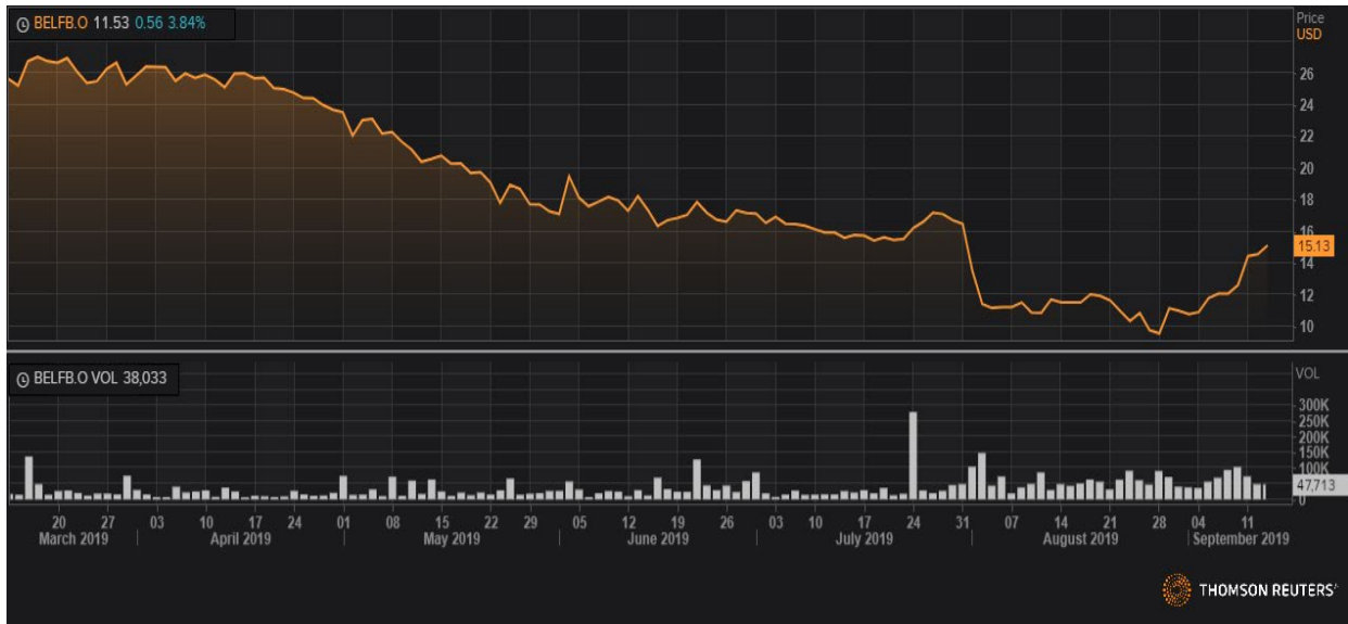
Figure 1 – Bel Fuse Inc. - Trading snapshot