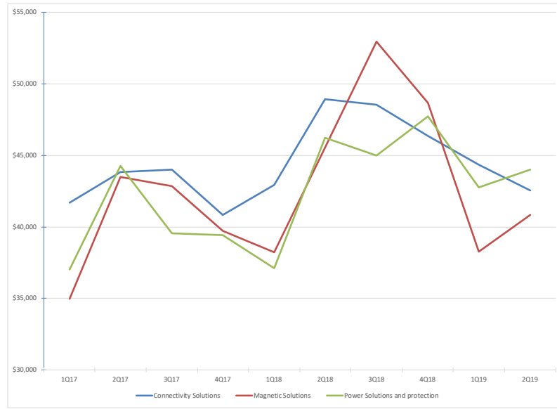
Figure 6 – Bel Fuse Inc. – Quarterly sales by segment by quarter 2017-present ($000)