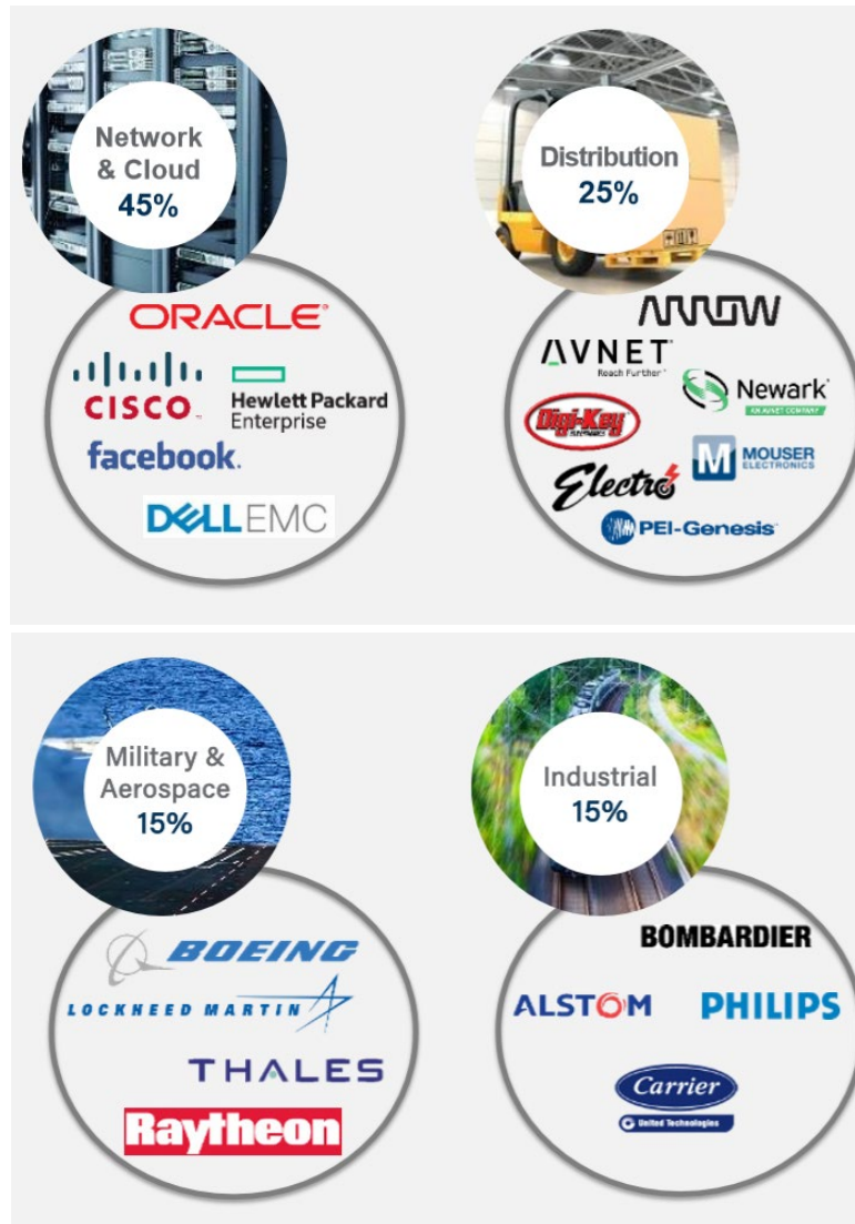
Figure 14 – Bel Fuse Inc. – Customer Map