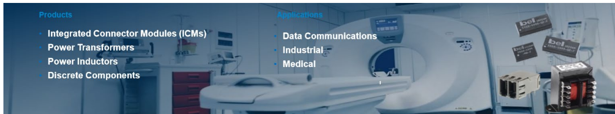
Figure 9 – Bel Fuse Inc. – Magnetic Solution Applications and Sample Image

Bel's Magnetics offers industry leading products. The Company's ICM products integrate RJ45 connectors with discrete magnetic components to provide a more robust part that allows customers to substantially reduce board space and inventory requirements. Power Transformers include standard and custom designs for use in industrial instrumentation, alarm and security systems, motion control, elevators, and medical products. Typical applications shown in Figure 9 and Product Map in Figure 10.